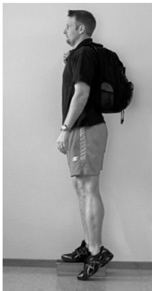
Figure 2 If there were bilateral symptoms the patients performed a leg press while standing on a box or a staircase to get up to the start position. This was done to avoid as much as possible concentric because of contraction in the calf muscle.

Twenty of the participants had unilateral symptoms, seven had bilateral symptoms, giving a total of 34 painful Achilles tendons. All participants had a long duration of pain (mean