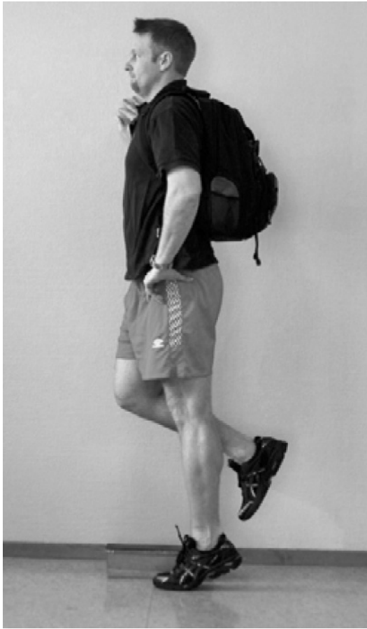
Figure 3 If there was no pain during the exercise the patients gradually filled a backpack with weights to reach a new level of painful training.

with the treatment and were back to their previous Achilles-tendon-loading activities. In this group, estimated pain on the VAS had decreased significantly from 69.9 (18.9) to 21.0 (20.6) ( p < 0.001 ).