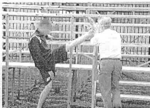
Figure 2. Static elevated hamstring stretch technique.

desired level of activity (3 sets result in too much soreness to participate the next day).